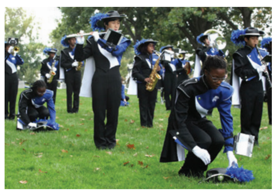
James Blake High School made this performance in memory of the 72 pedestrians killed in the Washington region in 2012.

"Band Together" Musical Assembly: Partner with your school's band to create a dramatic and memorable event. Ask the band director to choose a mournful music selection. Midway through the performance, a bell (or triangle) should ring every few measures in memory of someone killed while crossing the street. With each ring of the bell, a band member stops playing his or her instrument and lays it on the ground, along with his or her band hat. The song should end with a lone trumpeter playing amid a sea of abandoned instruments.